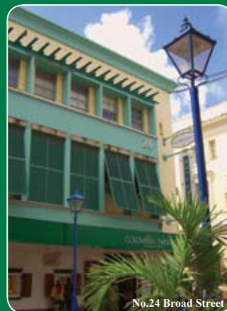
No.24 Broad Street