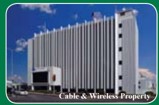
Cable & Wireless Property